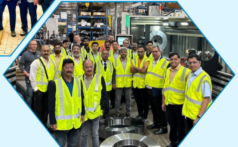
Floor tour of BuhlerPrince plant in Holland, Michigan, USA