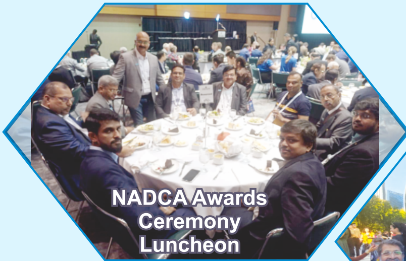
NADCA Awards Ceremony Luncheon