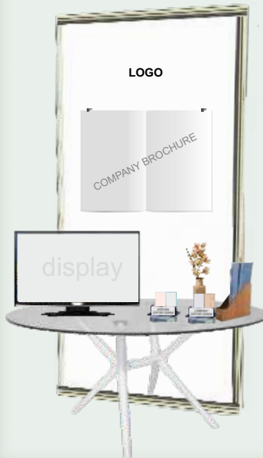
TABLE TOP DISPLAY